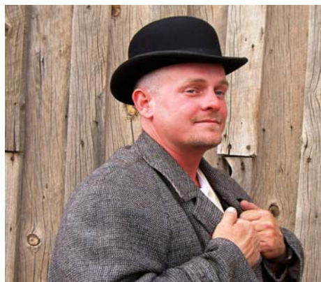
Our Hero! Harry Heartstone In hot pursuit of his evil twin, the dastardly Snipe Vermin