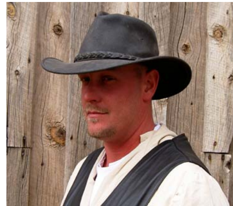
Villainous Snipe Vermin Lives to torment Harry